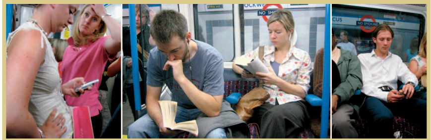
Figure 1. In the Tube's tight quarters at rush hour, passengers occupy themselves with many media forms: mobile phone games, books, and music players.

[Without a book, it's] a bit more boring. I just end up reading the ads or looking around. You are trying not to stare at someone and you are looking like a psycho.