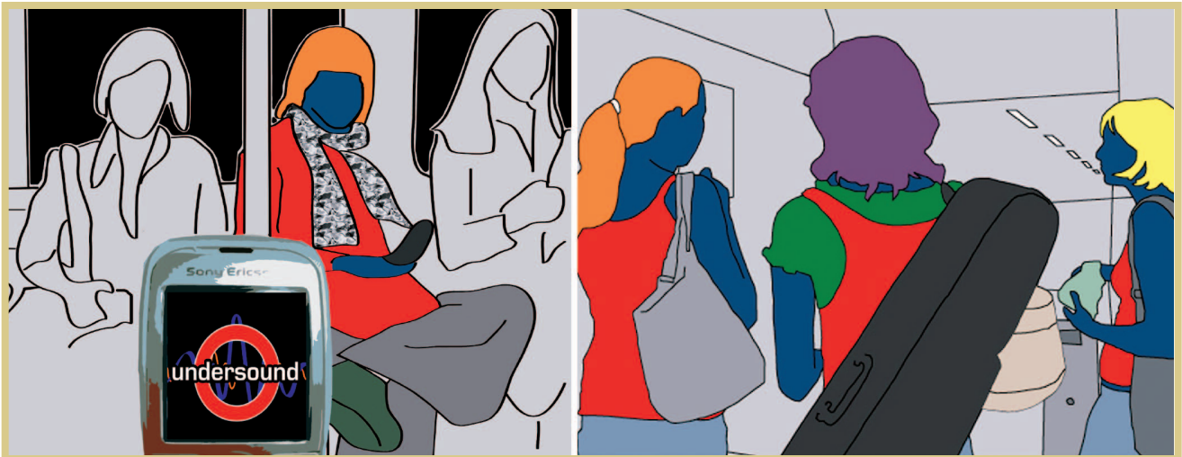
Figure 2. Undersound is a music-sharing application designed to explore riders' individual and collective experience of the Tube.

was instantly reminded of her train pulling into the station nearby her workplace. Because she listened to the same album every day for many months on her way to work, this song came to symbolize the moment of her arrival.